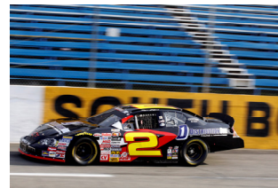
Ryan Gifford in the No. 2 Chevrolet

Ryan Gifford showed that consistency pays off when the NASCAR K&N Pro Series East headed to South Boston Speedway on April 3.