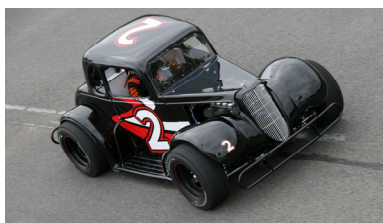
Revolution Racing Legends Car