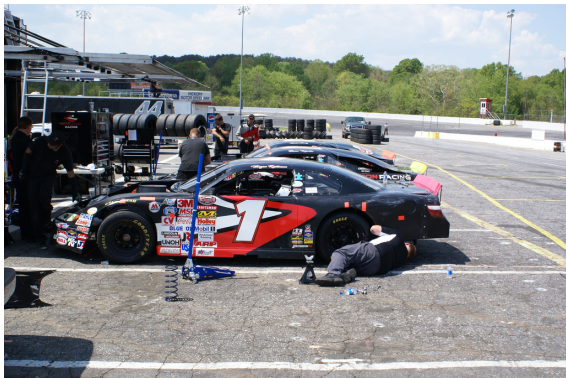
Revolution Racing Late Models at Hickory Motor Speedway

In a division where most teams are individually owned and operated single-car operations, Revolution Racing's Late Model program is doing something different, and on a much larger scale. With six development drivers and six full-time employees, Revolution is competing in the NASCAR Whelen All-American Series on Friday and Saturday nights at short-tracks in North Carolina.